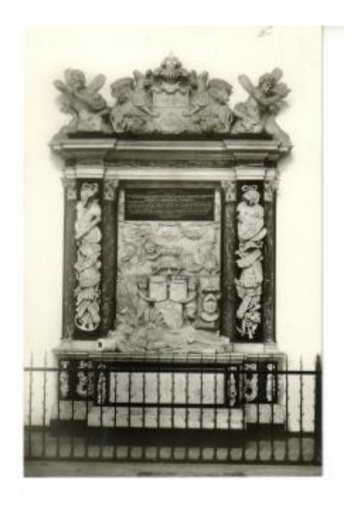
Admiraal Maerten Harpertzn Tromp Monument

The Tromp and van Kinschot families also played major roles in Delft. An outline of the Tromp, van Kinschot, de Roo and van Alderwerelt connection is shown on page 5.